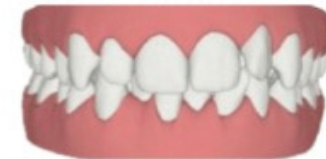
> Deep bite