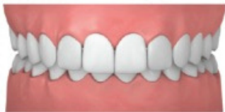
> Over bite